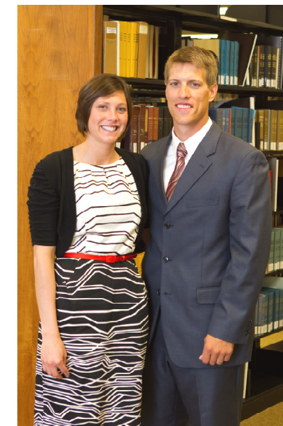
At Call Day -

Join us for a potluck meal and the important ministry and business of our congregation!